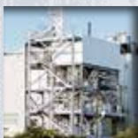
Combustion plants for the disposal of exhaust air, waste gases and liquid media