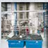
Ammonia recovery processes