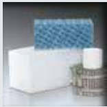
Structured packings for mass and heat transfer