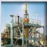
Turn-key units for waste gas scrubbing