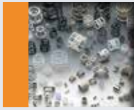
Tower packings for mass and heat transfer