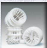
Biological carrier media